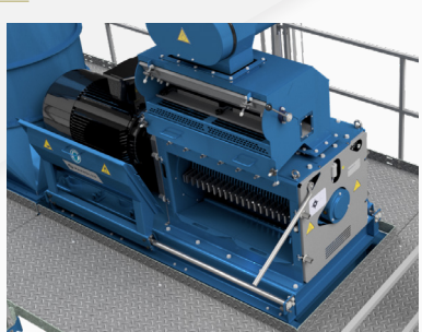
Hard-faced hammers with four wearable surfaces - all four edges can be used before a new set is required. The milling plant comes an insertable service tray to eliminate the risk of needlessly dropping hammers into the machine.